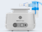
PARI BOY Classic Item No. 130G1201, Western Europe (de, fr, it, es, nl, en) incl. child and adult mask Item No. 130G1206, Eastern Europe (bg, el, hr, pl, ro, sl, et, lv, lt)