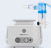
PARI BOY Pro Item No. 130G1001, Western Europe (de, fr, it, pt, es, nl, en) Item No. 130G1006, Eastern Europe (cs, el, hu, pl, sk, sl)