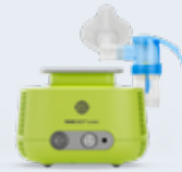
PARI BOY Junior Item No. 130G1301, Western Europe (de, fr, it, pt, es, en) Item No. 130G1306, Eastern Europe (el, hu, pl, sl)